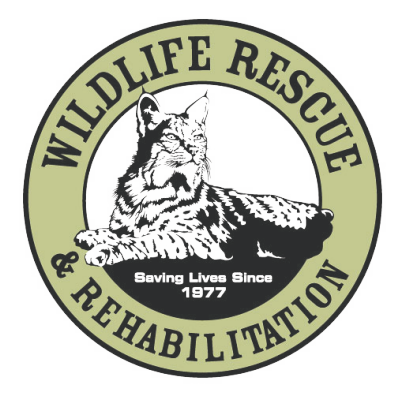
Wildlife Rescue & Rehabilitation 335 Old Blanco Rd, Kendalia, TX 78027