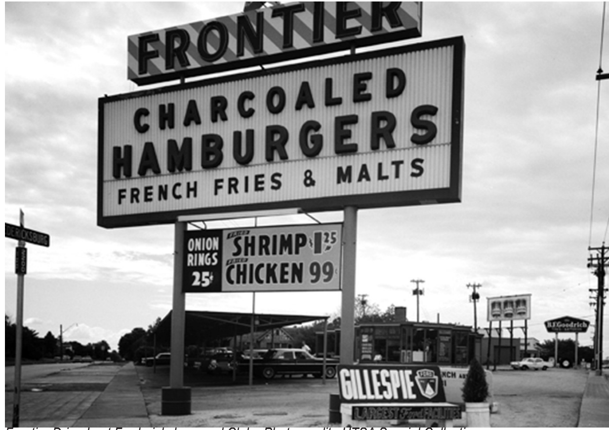
Frontier Drive-In at Fredericksburg and Club.

This restaurant was on the corner of Fredericksburg and Club, at the current pawn shop site. During the chain's heyday, from the 1950s through the 1980s, there were multiple Frontier Drive-Ins throughout San Antonio. At first, carhops took orders from customers and delivered to their cars. Later, Frontier introduced a speaker ordering system, which they claimed was the first in Texas.