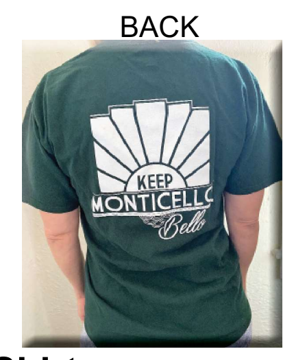
GET YOUR MONTICELLO MERCH ON!

$10 T-Shirts Available sizes: S, XL, 2XL