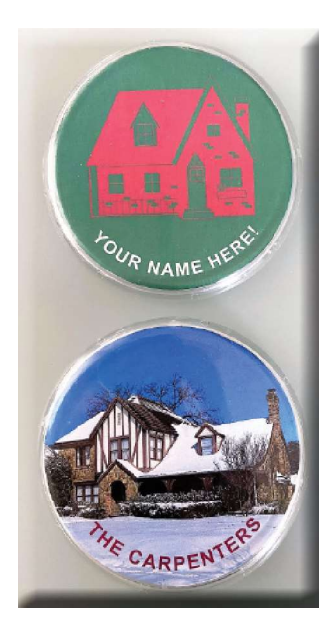
$10 Custom Buttons

Write a short essay that describes you. It can be an experience, a goal, or an achievement in your life. It can also be a short autobiography. Please limit your essay to two pages. Your essay may be handwritten or typed.