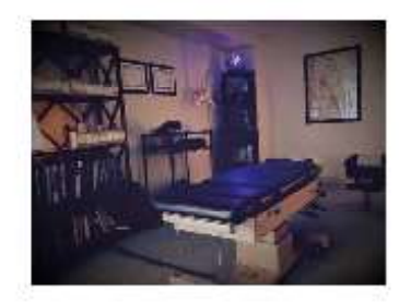
Lenestar Health Group 7475 Callaghan Rd. STE 304 San Antonio, TX 78229