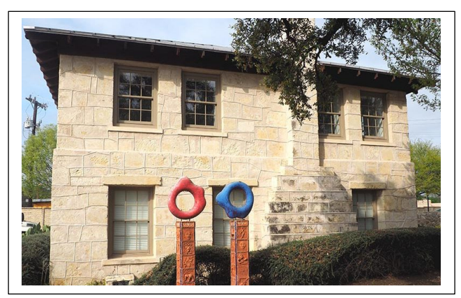
Bihl Haus Art, a beautifully restored space within the grounds of the Primrose Apartments