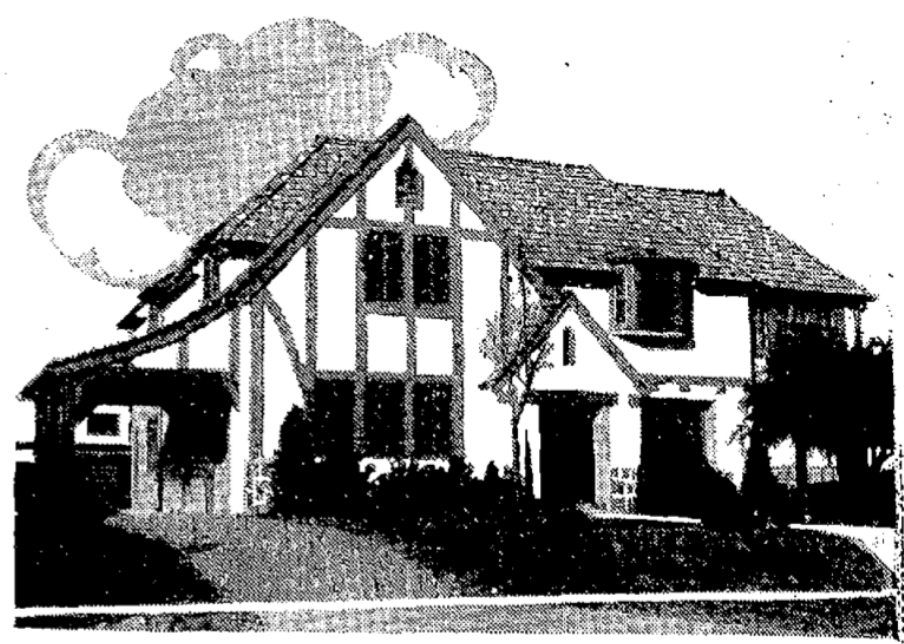
211 MARY LOUISE DRIVE IN WOODLAWN DISTRICT