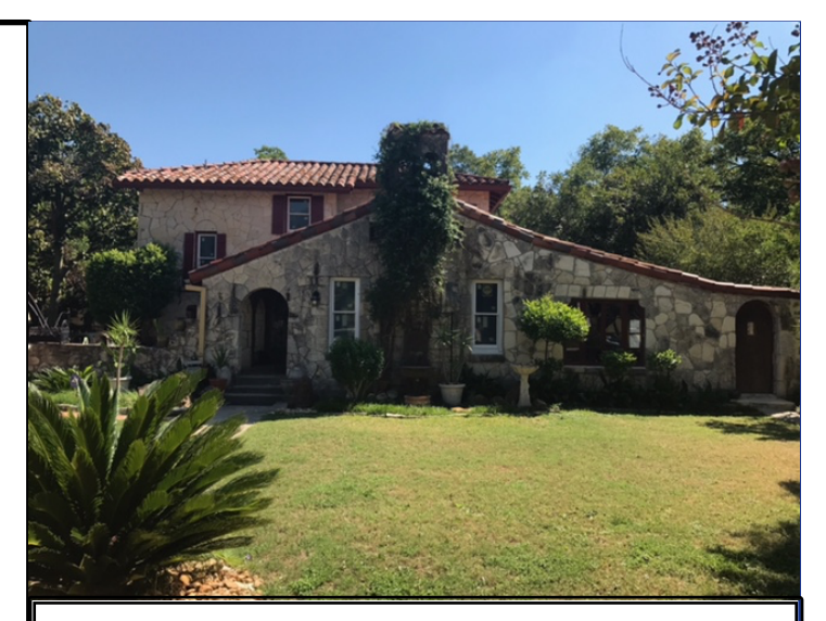
The Lerma House