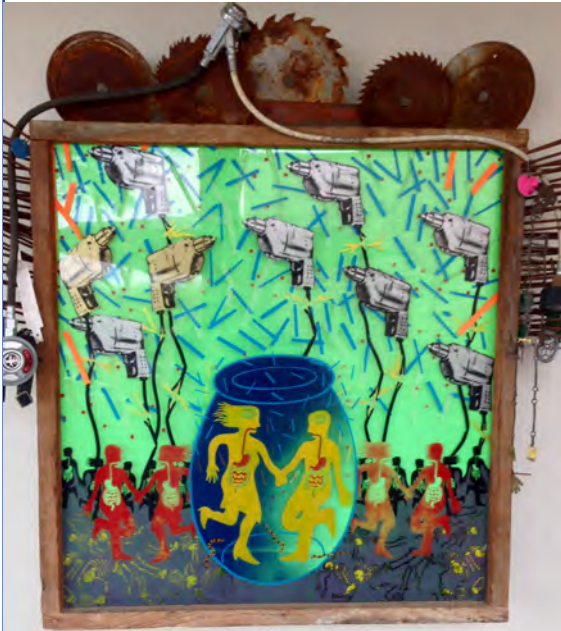
Artwork by Alex de Leon

In 1996, de Leon was awarded a residency program from Artpace in San Antonio and produced an installation on the nightclub of addictions, titled 'Just Kuz You Don't Think Don't Mean They Ain't . Foam skeletons hung from giant meat hooks inside a chicken wire enclosure.