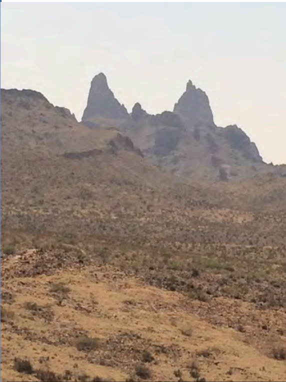
Mule Ears, Texas