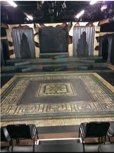
The stage setting for Medea at the Classic Theater

The format is the black box, Roush said. "The box may be moved in any configuration. Currently, we seat 80 people. Mark Stringham, the director of the production, chose the thrust configuration with the audience seated on three sides, thus hemming in the characters. But people like the configuration to change with each production." She said that maximum seating capacity is 99. So the seating is intimate. Audience members easily see each other. "On opening night of Medea , someone in the audience fainted." This reporter wondered, "What happened?" "Water was brought to the person and the play went on. Really, the audience becomes a part of it all and each night is different," she said.