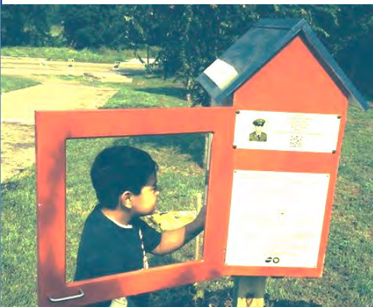
KLRN's Little Library, dedicated to the memory of a veteran

My hope is that the others on the Facebook page who have indicated an interest will join in the installation of these libraries. Wouldn't that be another great distinguishing feature of Monticello Park?