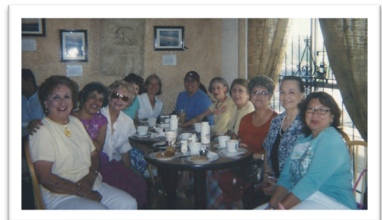
Monticello Park Bunco Group

But many neighbors remember her sense of humor, her matter-of-fact way of dealing with cancer, and the way she crinkled her nose. That nose twitched when she did not like or agree with something that was said or done. And who could forget her gorgeous hair with its' many curls. Cancer did not take that or her spirit that always looked on the sunny side.