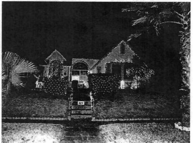
De Los Santos family, 300 block Furr